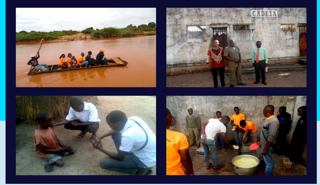
above: prison ministry in Gorongosa and outreaches to different locations